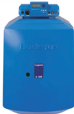
GB125 Low-NOx Condensing Oil Boiler 75,000 - 121,000 BTU/hr