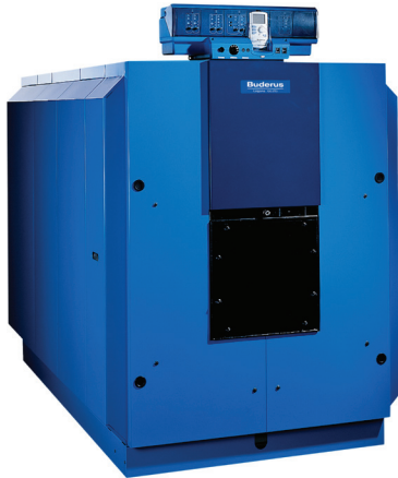
G615 Series 1,951,000 - 3,982,000 BTU/hr