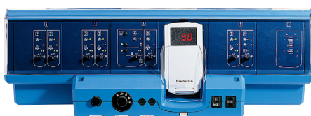
Logamatic 4000 Control