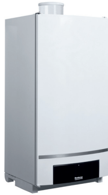
GB142 - GB162 Wall Mounted Condensing Boilers and Cascade Components 84,000 - 1,332,000 BTU/hr