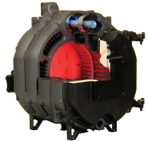
G315 Series 350,000 - 768,000 BTU/hr