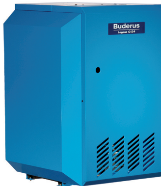
G124X - 234X - 334X Gas-Fired Boiler 74,000 - 542,000 BTU/hr