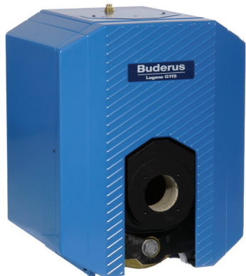
G115 - 215 - 315 Oil-Fired Boilers 85,000 - 768,000 BTU/hr