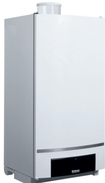
GB162 Wall Mounted Condensing Boiler 290,000 - 333,000 BTU/hr