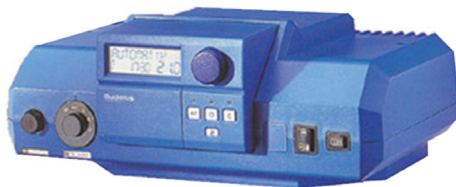
Logamatic 2107 - Single Boiler