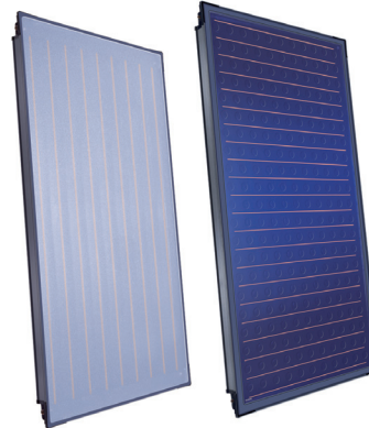
Logasol SKS 4.0 | SKN 3.0 Solar Flat Plate Collector