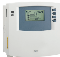
TR0301 U Solar Controller