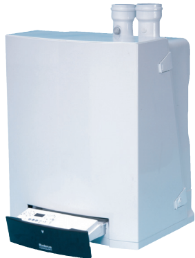
GB142 Wall-Hung Condensing Boiler 84,000 - 218,000 BTU/hr