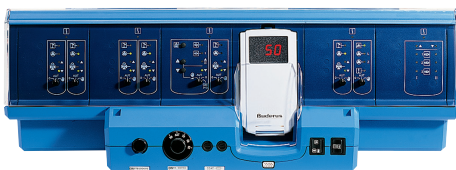
Logamatic 4000 - Multiple Boilers