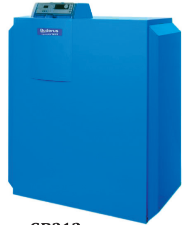
GB312 328,000 - 1,028,000 BTU/hr