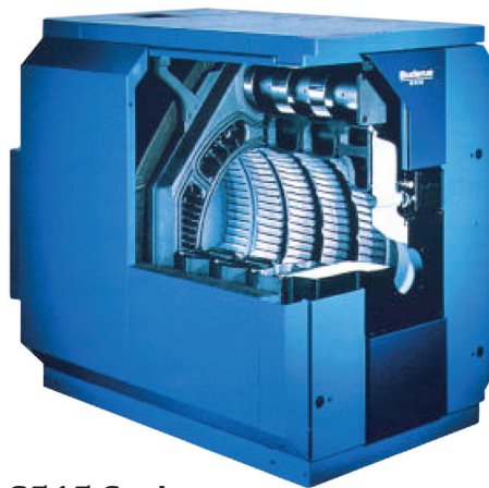
G515 Series 818,000 - 1,773,000 BTU/hr