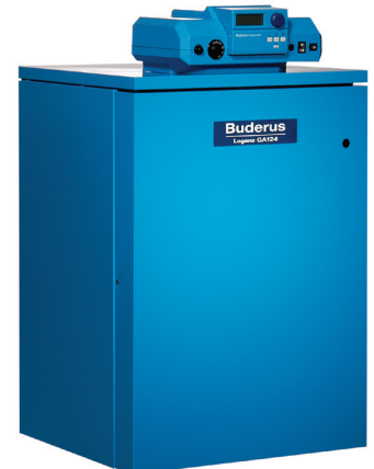
GA124 - 244 Sealed Combustion Boiler 70,000 - 212,000 BTU/hr