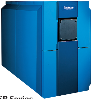
SB Series SB615: 484,000 - 2,104,000 BTU/hr SB735: 2,650,000 - 4,079,000 BTU/hr